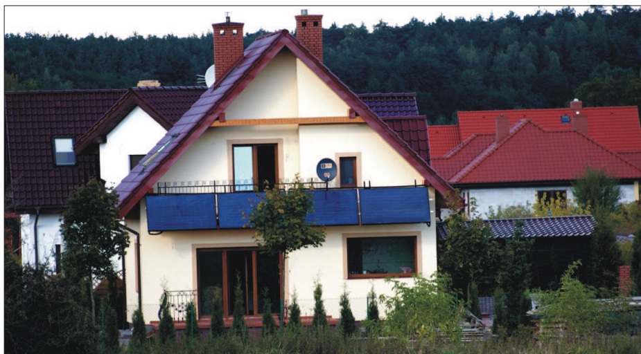
Fig. 3: A single family-house with solar collectors in Czarnowo – a suburban area of the Bydgoszcz–Toruń agglomeration (Kujawsko-Pomorskie Voivodship) – an example of the BAPV system.