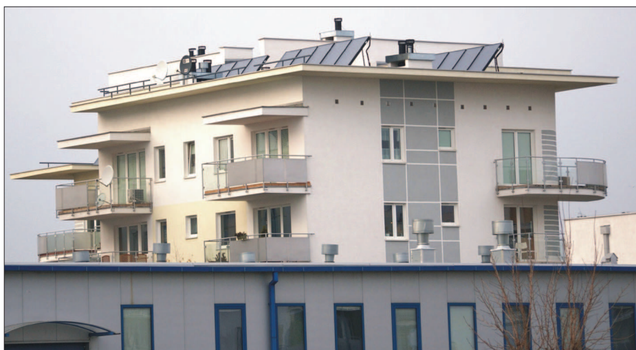
Fig. 4: A multi-family building with solar collectors managed by Spółdzielnia Mieszkaniowa “Budowlani” in Bydgoszcz (Kujawsko-Pomorskie Voivodship).

hydropower plants are the most important, which have been found in 87% of poviats using small-scale renewable energy systems. Most of the poviats have a long tradition of harnessing water to generate power (northern and western Poland).