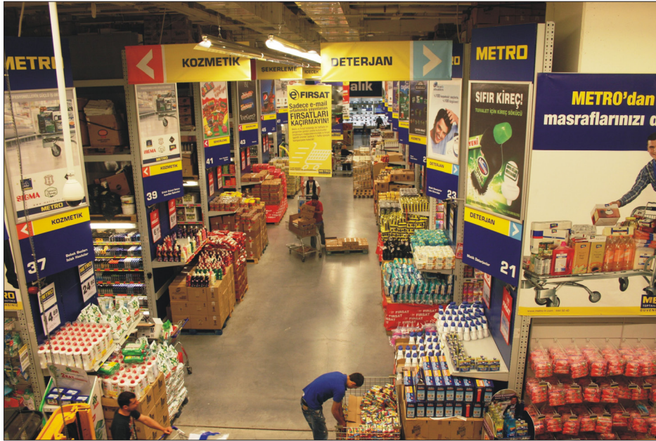
Fig. 2: Metro Cash&Carry store in Istanbul