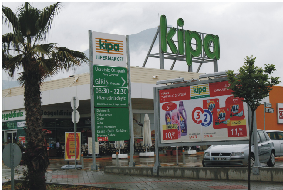
Fig. 3: Kipa store in Fethiye. The hypermarkets belong to the UK-chain Tesco